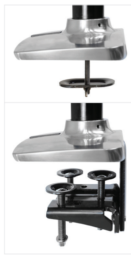
DESK CLAMP ATTACHES TO EDGE UP TO 2.5" (65 MM) THICK